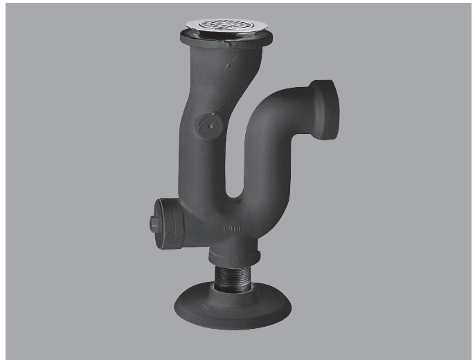
7798.020 / .030 IS FOR ENAMELED IRON SERVICE SINK