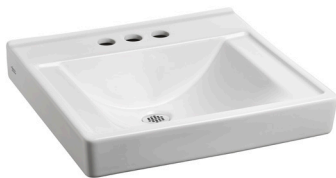
Model 9024.904EC 4" Centers Less Overflow