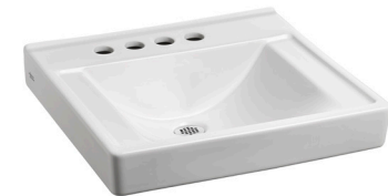
Model 9024.924EC 4" Centers With Left Hand Soap Dispenser Less Overflow