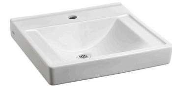
Model 9024.901EC CHO Less Overflow