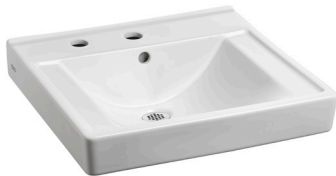
Model 9024.021EC CHO With Left Hand Soap Dispenser