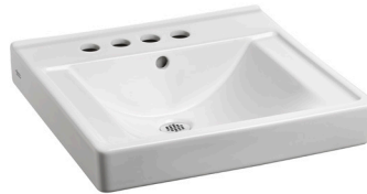
Model 9024.024EC 4" Centers With Left Hand Soap Dispenser