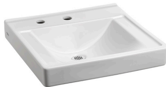
Model 9024.921EC CHO With Left Hand Soap Dispenser Less Overflow