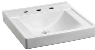
Model 9024.908EC 8" Centers Less Overflow