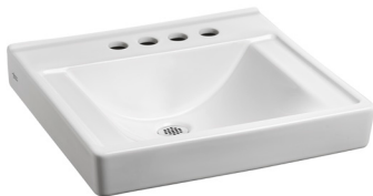
Model 9024.914EC 4" Centers With Right Hand Soap Dispenser Less Overflow