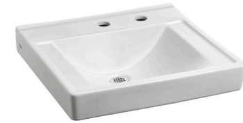
Model 9024.911EC CHO With Right Hand Soap Dispenser Less Overflow