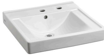
Model 9024.011EC CHO With Right Hand Soap Dispenser