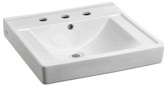
Model 9024.008EC 8" Centers