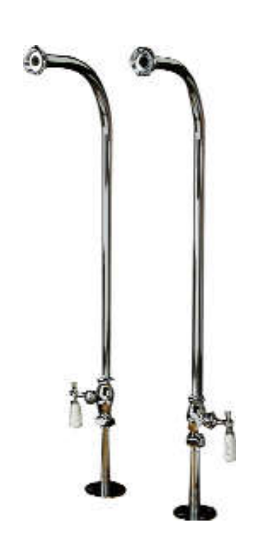
30" (30-1/2" with nut)