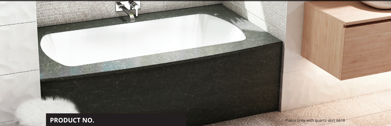
Piatra Grey with quartz skirt 6618

Monarch is a refined collection of therapeutic baths with distinctive deck surfaces, for a look that's noble and pure. The Collection offers luxurious bathtubs: the Monarch Grand Luxury models, featuring splendid One-piece Quartz deck.