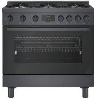
HGS8645UC Black Stainless Steel