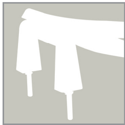
3" LIFT HINGES AND BUMPERS