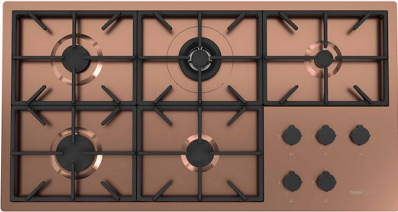
Milano Cooktop Copper 5 burners