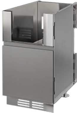
Fillers are adapted to the dimension of your burner

18" Grill Base Cabinet 1 door right hinges