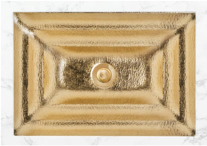
Shown in AG04C-BRS

See our "Artisan Glass Fact Sheet" for additional details.