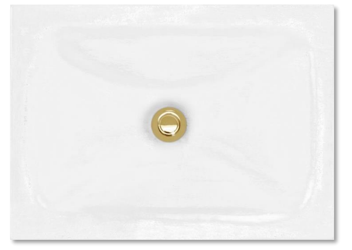
AG18B-01 Shown with D005 UB