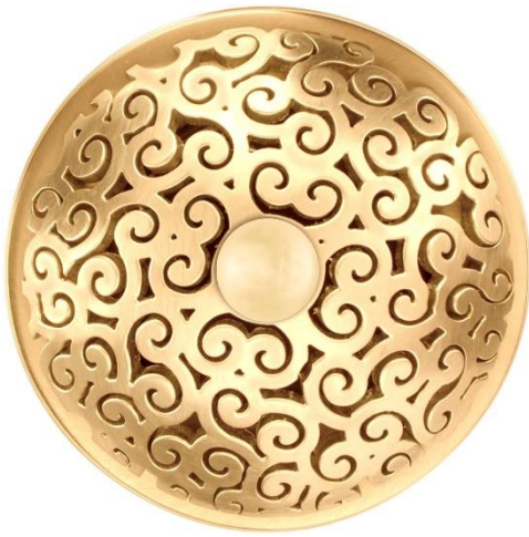
Shown in "SSB-SCR01"