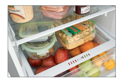
LUXURY GLASS SHELVING & DRAWERS Glide out smoothly and fully extend div

Glide out smoothly and fully extend giving you easy access to what's inside.