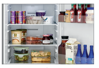
LUXURY-DESIGN® LED REFRIGERATOR LIGHTING Our ramp-up designer LED lighting is as beautiful as it is functional, keeping refrigerator contents clearly visible.