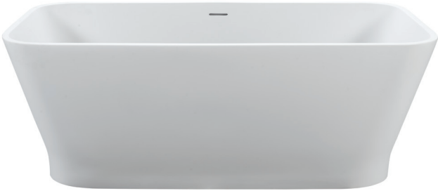
Features an integrated overflow.