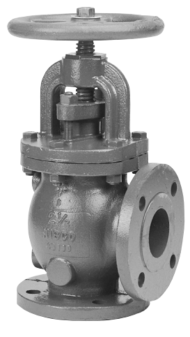
F-838-31 Flanged-Raised Face

WARNING: This product can expose you to chemicals including lead, which is known to the State of California to cause cancer and birth defects or other reproductive harm. For more information go to www.P65Warnings.ca.gov.