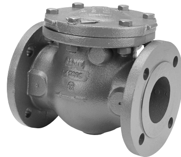
F-938-31 Flanged-Raised Face

1 5"-12" ductile iron disc with bronze face ring and disc bolt