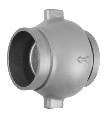
KG-900-W-LF 350 Grooved