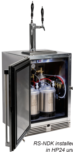
RS-NDK installed in HP24 unit