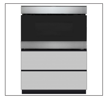
Pedestal slides under the counter for hassle-free installs