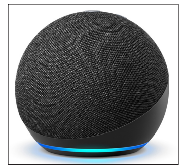
Hands full? Just Ask Alexa, "Alexa, open the microwave" for a little help in the kitchen!