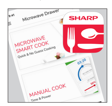
Pairing the Sharp Kitchen App activates the smart features and voice control.

The concealed, glass, Touch Control panel is easy-to-see and operate at a convenient 45° angle, keeping all of the controls at your fingertips when you need them, and completely out of sight when you don't. The modern, edge-to-edge, black glass and stainless steel design with bright, LED interior lighting and stylish floor pattern compliments your kitchen and pairs beautifully with other stainless steel appliances.