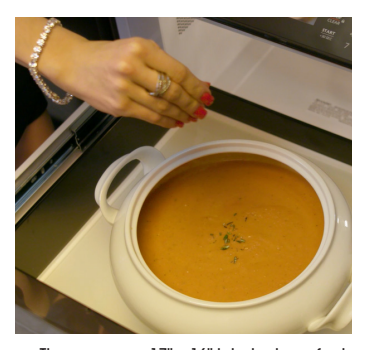
The generous 17" x 16" interior is perfect for platters, casseroles & serving bowls.