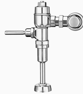
Variation Not Shown: Less Vacuum Breaker