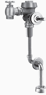
Variation Not Shown: 3" Metal Oscillating Push Button