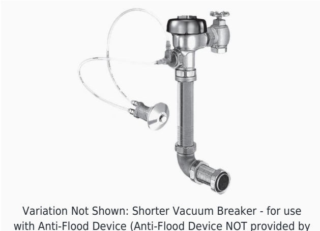
with Anti-Flood Device (Anti-Flood Device NOT provided by Sloan)