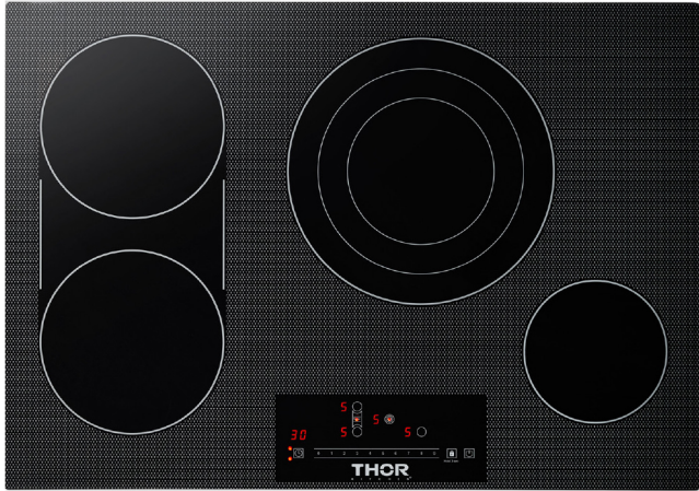
Product: 30 Inch Professional Electric Cooktop