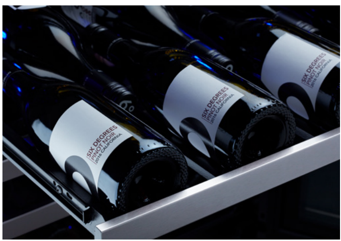
Easily stores Pinot Noir and Chardonnay bottles