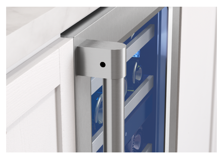
Door Lock in Pro-Style Handle